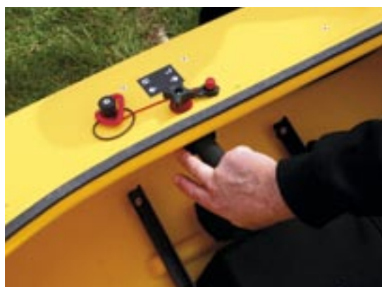
Easy peasy: Push forward to go right, pull down to go left