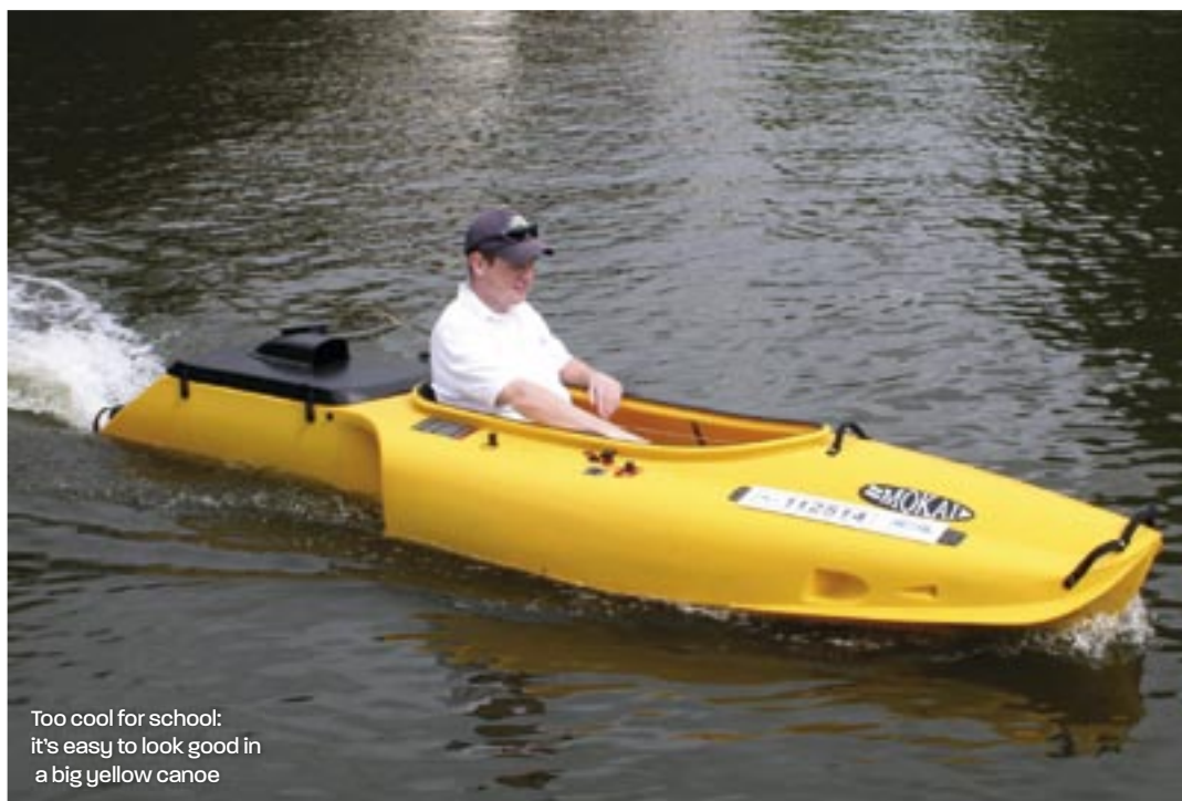
Too cool for school: it's easy to look good in a big yellow canoe

MBM's tough taskmasters put some clever new boating kit through its paces. The result? You can buy with confidence