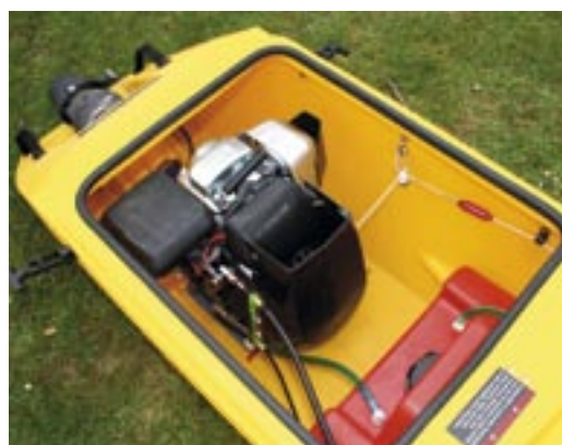
The 6hp engine and petrol tank are easily installed